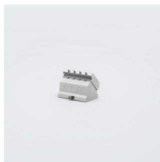
Rhythm Elastic nozzle